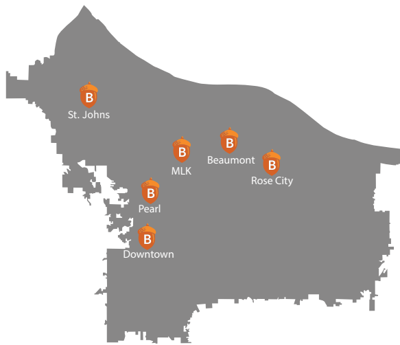
City of Portland, Municipal Boundary

Total loan dollar commitments in millions to businesses and nonprofits through March 31, 2019